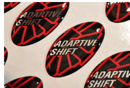
Adaptive Shift console decal - Series 1 – $10.00