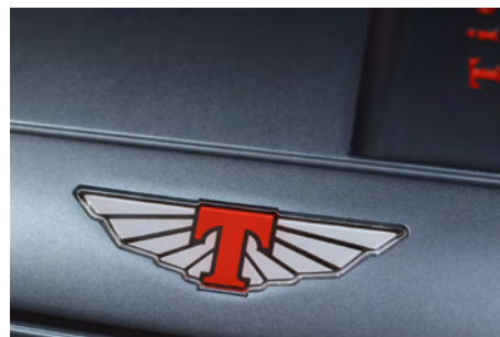
T-Series and XR8 Engine Cover Wing Decal – $15.00