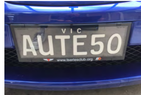
Club Number Plate Covers – $60.00