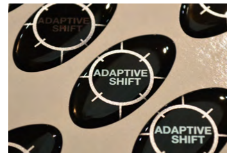
Adaptive Shift console decal - Series 2 – $10.00