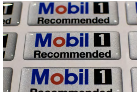
Mobil 1 Engine Cover Decals – $20.00-$30.00

If you do not find anything that you like, head to our SpreadShirt store and customise your own. We reinvest our funds into OEM quality badges and parts to sell for members.